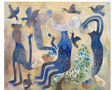
MANUEL MENDIVE (B. 1944)

Untitled bronze 13 x 24 x 20 in. 15 x 28 x 20 in. dimensions with base Estimate: $20,000-25,000