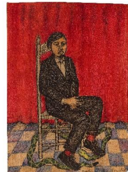
NAHUM B. ZENIL (B. 1947)

Solo gouache and ink on paper 6¾ x 4¾ in. Executed in 1984.