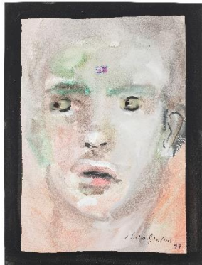
JULIO GALÁN (1958-2006)

Untitled watercolor and collage on paper 12¾ x 9½ in. Executed in 1999.