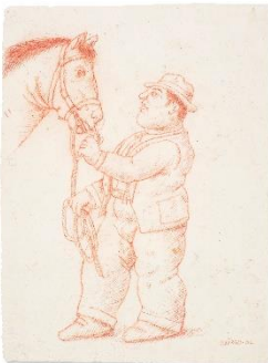
FERNANDO BOTERO (B. 1932)

Man with Horse sanguine on paper 15½ x 11½ in. Executed in 2002.